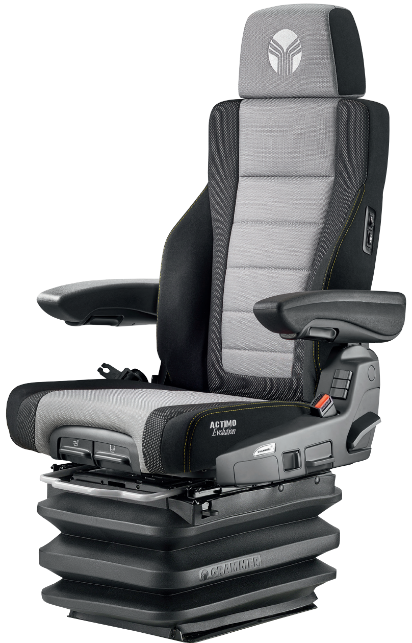
Illustrations may not show standard equipment.

GRAMMER offers the ACTIMO® EVOLUTION CC with a pre-mounted console for the control carriers especially for use in excavators. Available as an optional extra, the control carriers make operating the machinery particularly convenient. The controls of this seat are located on the front side, ensuring good accessibility (joysticks not included).